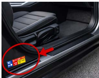
Passenger door at the B-pillar