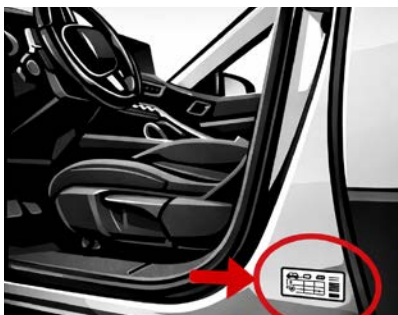
Driver's door at the B-pillar

To find the correct MULTONA colour, you need to know your vehicle's original colour code. Depending on the manufacturer and model, this can be found in different places; listed below are the four most common locations where the colour code can be found.